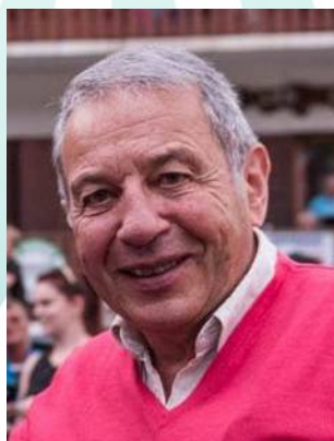
Jean-Pierre ROUGEAUX, Mayor of Valloire